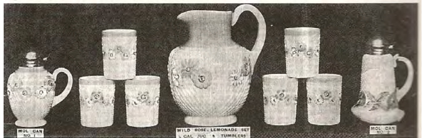
Figure 11Q3 More "Cosmos", but note "Fishnet and Poppies" on far right never before attributed.