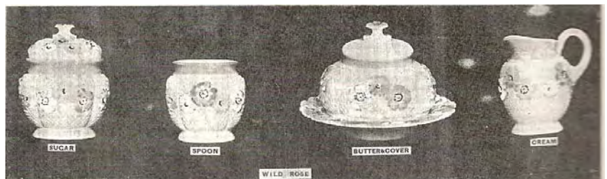
Figure 11P3 Called "Wild Rose" here; known as "Cosmos" now.

These are two of Fostoria Glass Co.'s lamps shown in a catalog which was from c. 1897. Note the similarities to Consolidated's Cosmos pattern. The lamp on the right is called Marguerite , and the other is Mayflower .